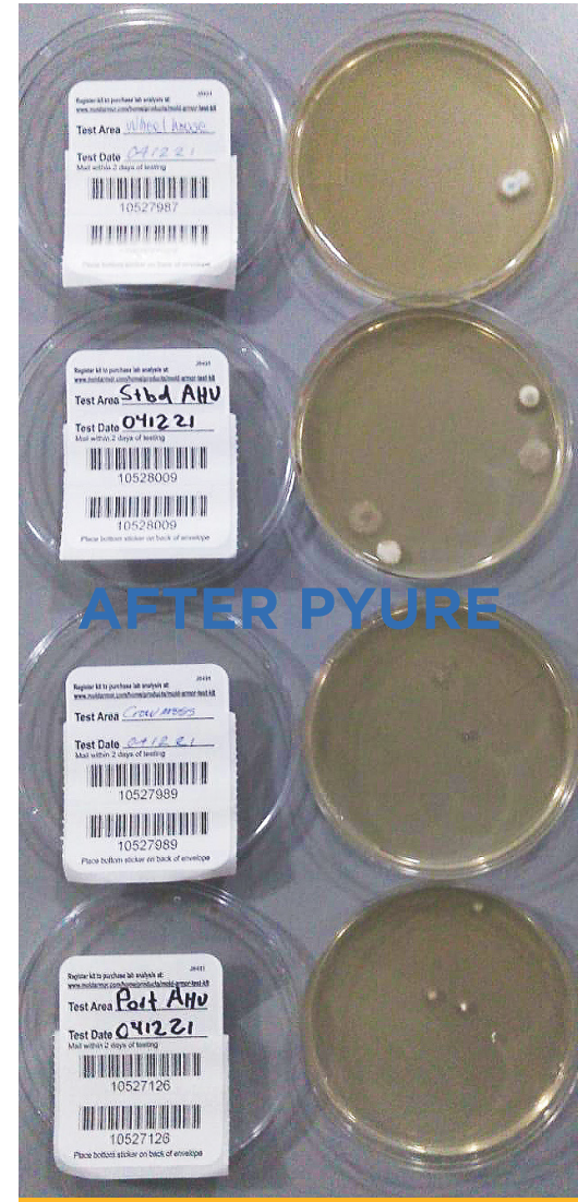
Figure 2, Mold results after three days of exposure to the ship's air while treated by Pyure Technology©

If your commercial, industrial or maritime business is seeking Dynamic Protection for mold, virus, bacteria, odors or Volatile Organic Compounds (VOCs), connect with us to develop a test package similar to this case study.