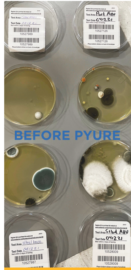
Figure 1, Mold results after three days of exposure to the ship's existing air

Another test was run after the Pyure IDI™ purifiers were activated with four new mold test kits placed in the same locations. After the purifiers ran continuously for seven days (more than double the length of the first test), the kits were removed and photographed as shown in Figure 2*.